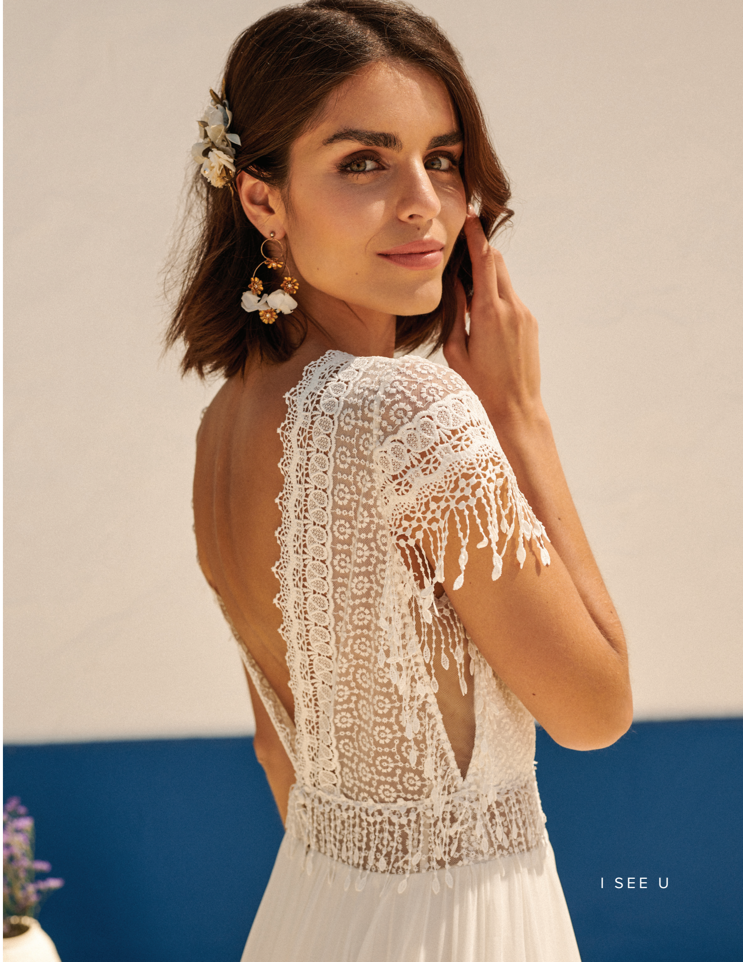
I SEE U